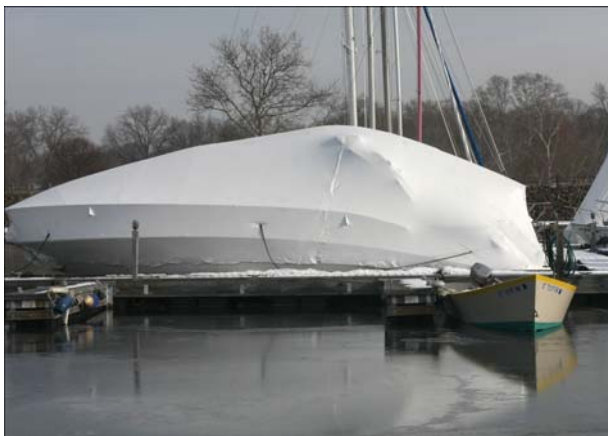
February 7, 2009. Six more weeks of winter? Commodore Loglisci’s Goo Goo Eyes under wraps on a cold February morning.